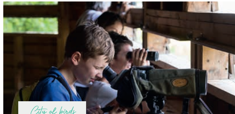
City of birds