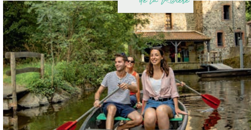
The Maison de la Riviere

The Maison de la Riviere, a beautifully restored former water mill, is set in a stunning natural reserve of over 5 hectares. Discover various fun exhibits which explain the surrounding ecosystem and the daily operations of the watermill. The visitors centre offers an interactive guide especially adapted specifically for children. Why not take a relaxing excursion by a flat-bottomed boat (punt), or explore the many foot trails.