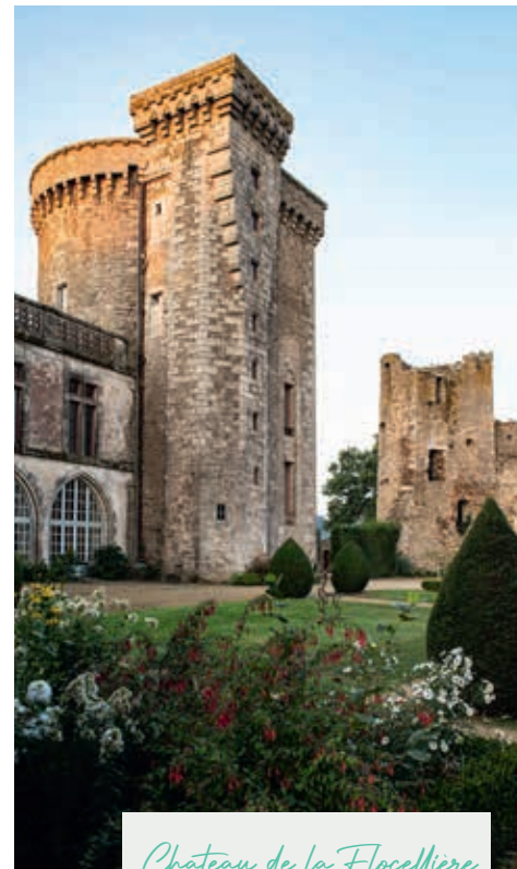
Chateau de la Flacelliere

The Cité des Oiseaux, a 56-hectare bird sanctuary, invites you to take a real nature escape in the heart of the Vendéen countryside. Bring your binoculars to discreetly observe the comings and goings of the birds that inhabit this remarkable natural site. Stroll along the banks of the pond and enjoy an outdoor naturalist photo exhibition as well as a special indoor display area.