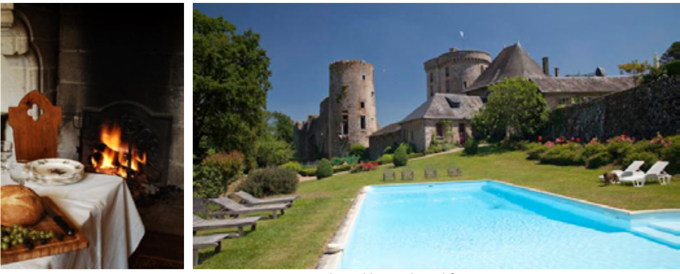
Shared heated pool from in summer