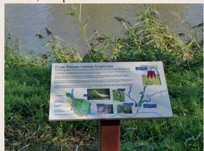
Discovery trail in the « Basses Vallées Angevines »

to the prosperity of the village. These wooden river boats were over 30 metres long and were used to transport cereals, stones, hemp and wine to the Loire.