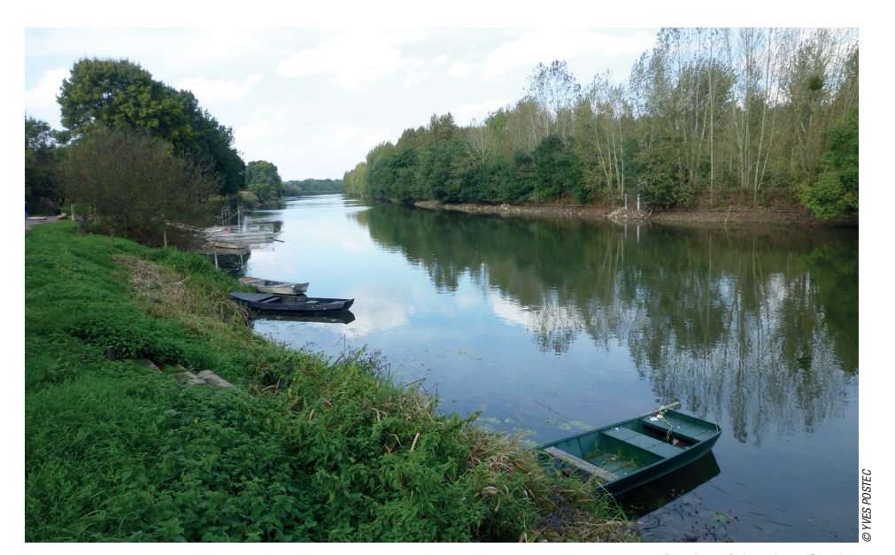
Banks of the river Sarthe